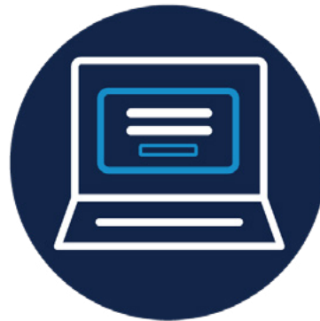
How to order postcards