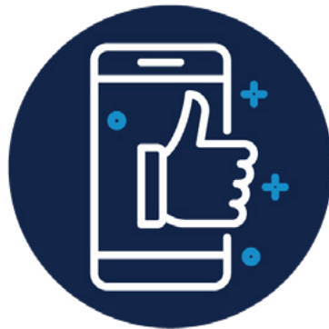
Social media tips and resources