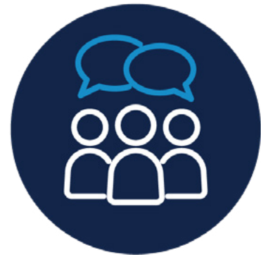
Client engagement ideas