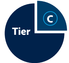
Max equity fund allocation 75%